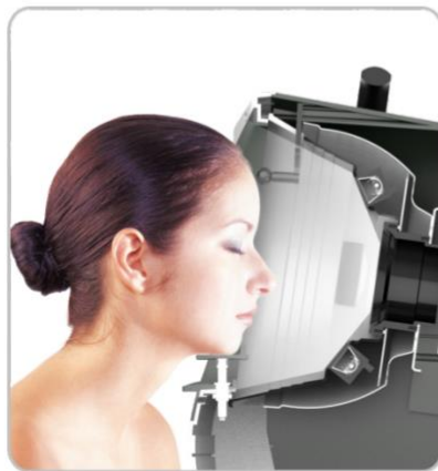
visible light Sketch